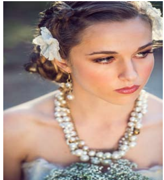
Global Wonders exclusive Bridal Line launching Spring 2015!